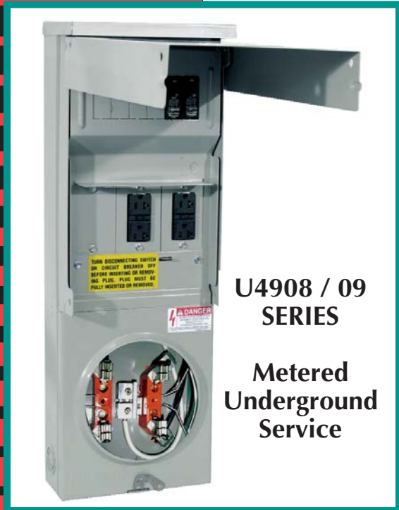
U4908 / 09 SERIES