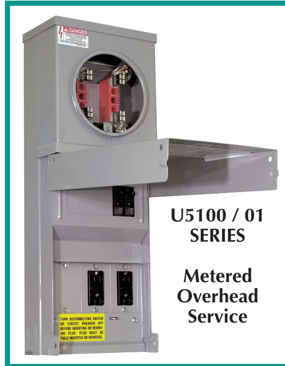
U5100 / 01 SERIES